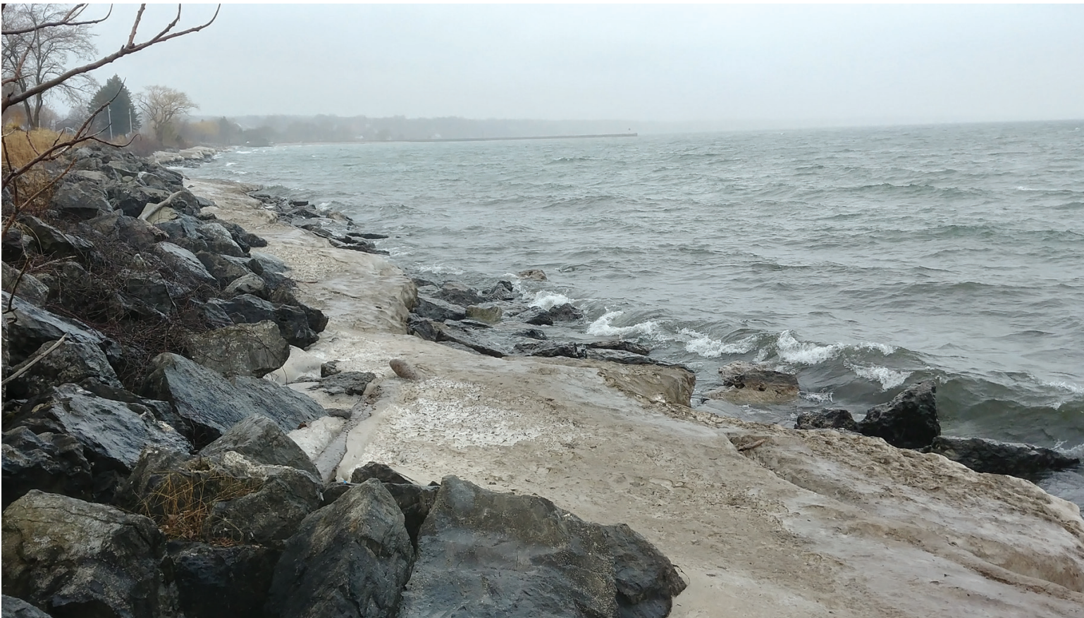
Figure 7. Ice-covered rock rip-rap revetment, Irondequoit Bay (Monroe County, NY).

Hard structures generally impede important coastal processes such as littoral drift of sediments and can compound impacts from intense wave energy, resulting in significant erosion to neighboring shorelines. Gray shoreline structures may also deplete sensitive coastal ecosystems and disrupt habitat connectivity.