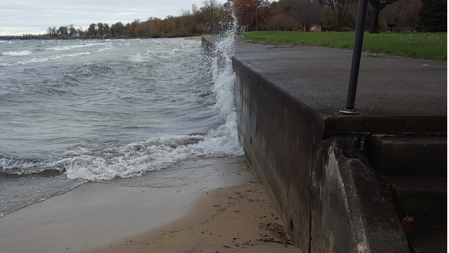
Concrete bulkhead deflecting waves, Westcott Beach State Park.

Cast-in-Place Concrete: This type of bulkhead resembles a concrete seawall except that is smaller in size. Like a sheet pile bulkhead, this bulkhead relies upon a anchoring to retain its vertical position and to resist wave action.