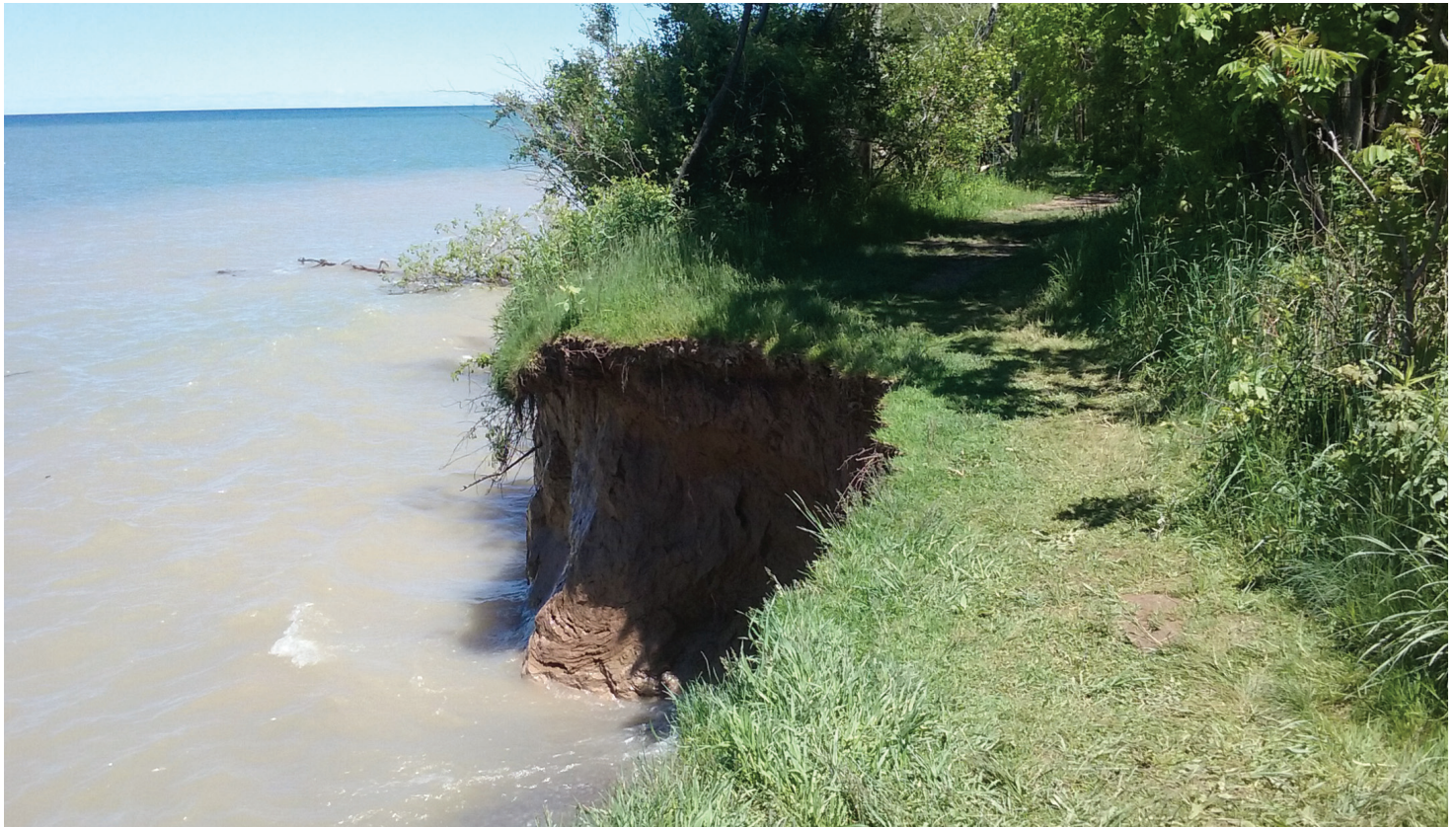
Bluff erosion at Chimney Bluffs State Park, Summer 2017.

The stability of coastal bluffs along New York's Great Lakes depends on the action of the surface water over the face of the bluff as much as it does on the material of the bluff, steepness of the slope and wave action at the toe of the slope. Human disturbances on the bluff may also affect stability.