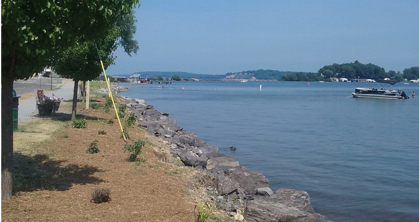
Nature-based shoreline employed at Sodus Bay (Wayne County, NY).