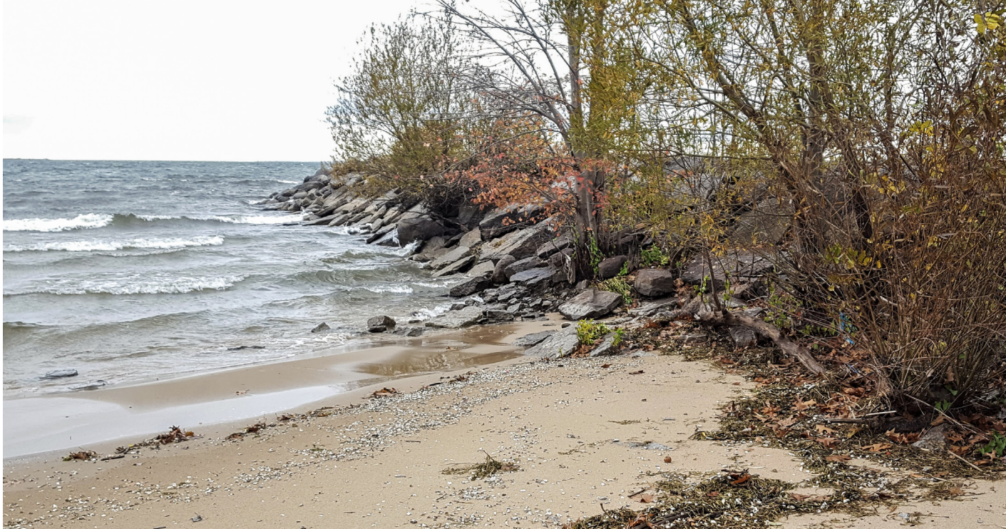
Small rubble mound groin with vegetation, Westcott Beach State Park.