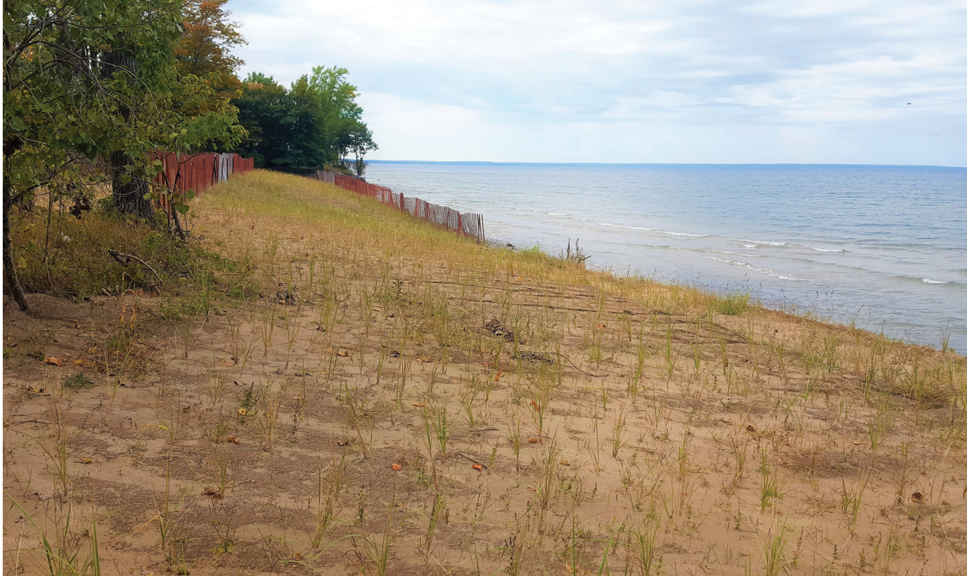
Ongoing dune revegetation and sand fencing placed at Sandy Island Beach State Park.