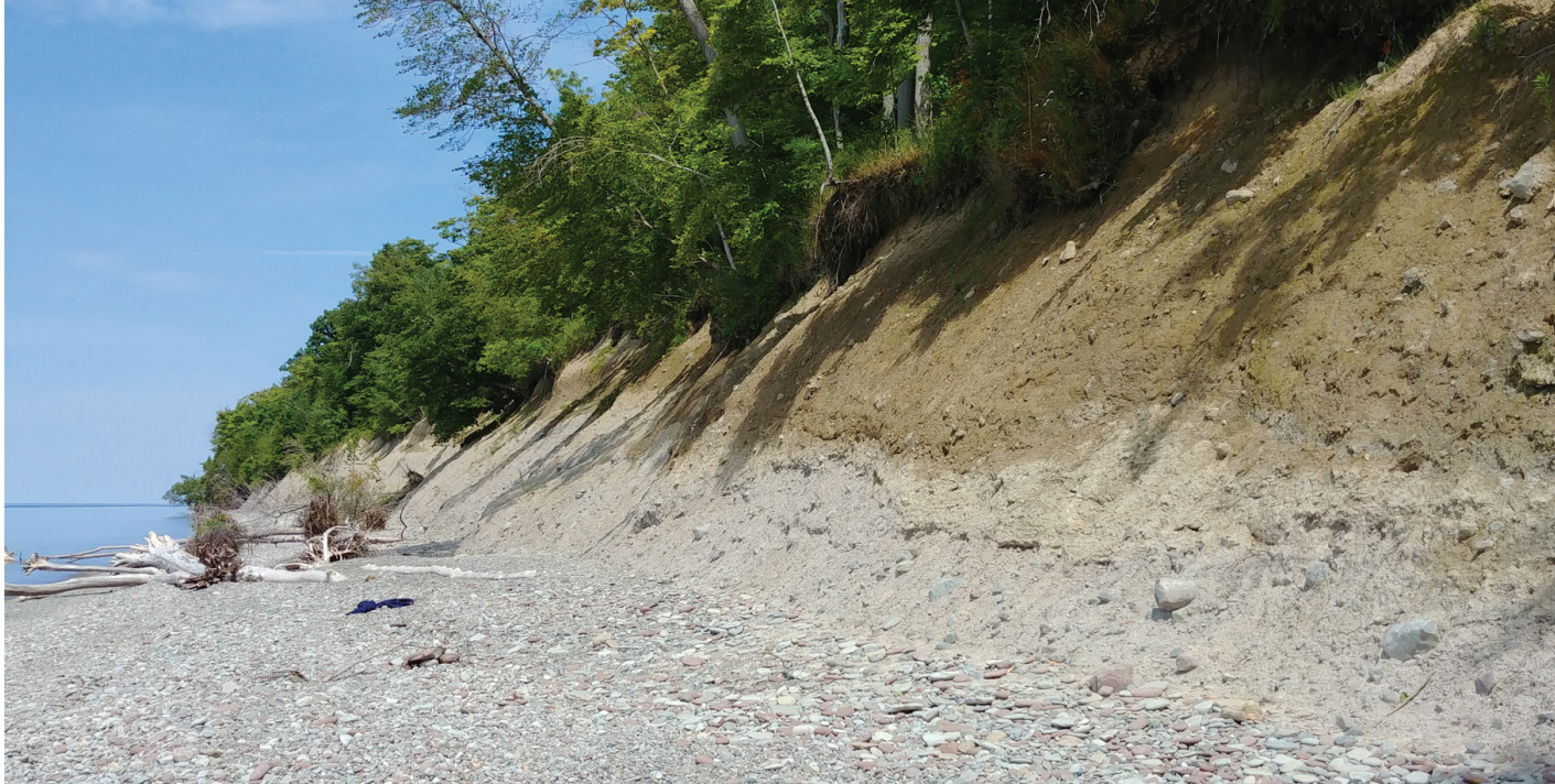
An eroded bluff composed of glacial outwash and till, Sterling, New York.