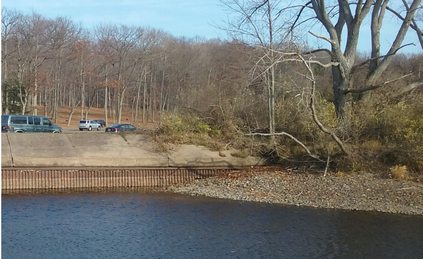
Concrete and steel sheet pile seawall protecting a small harbor, Westcott Beach State Park (Jefferson County, NY).