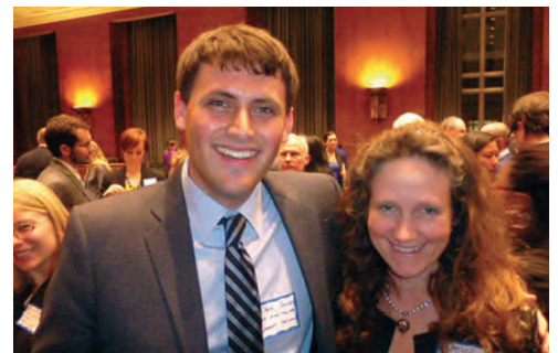
Top: Zachary Schulman will participate in an Arctic marine domain awareness exercise.