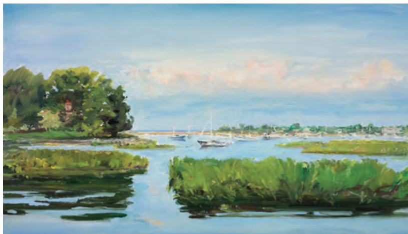
Mount Sinai Harbor on Long Island's north shore, one of 50 Long Island Sound embayments being studied for the risk of eutrophication in a newly-funded research project.